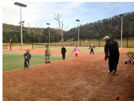
(Kids lessons on Friday morning)

Facebook: www.facebook.com/SteelsCreekTennisClub