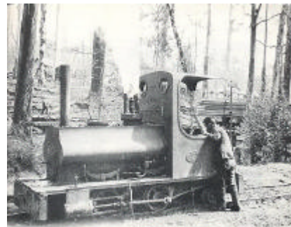
on Richards Tramway

Walk from Starlings Gap along tramways of the Ada River valley through Myrtle Beech gullies & giant Mountain Ash. The history tour will start at "The Bump" at the intersection of Big Creek Rd and Yarra Junction – Noojee Rd 6 klm east of Powelltown. Melways 512 or 612 T4. Discover the link between this tiny steam locomotive and one of the historic sites that we will be visiting.