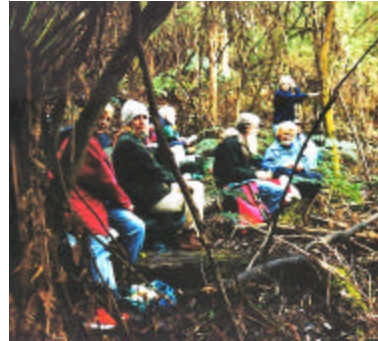
Clamberers having lunch at Big Pats Creek