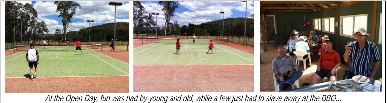
At the Open Day, fun was had by young and old, while a few just had to slave away at the BBQ...